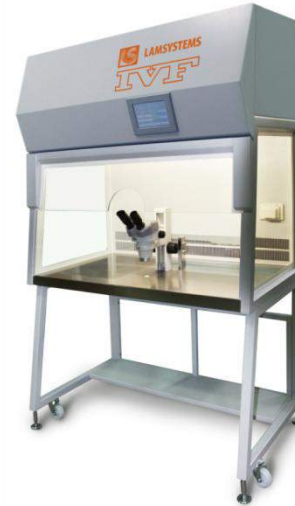
IVF Work Stations