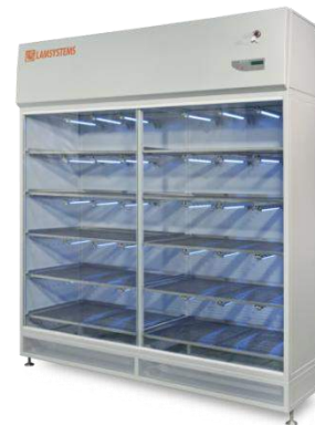
Sterile Storage Cabinets