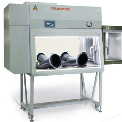
Class III Vis-a-Vis