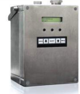
Formaldehyde and Ammonia Evaporator