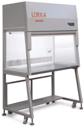
Vertical Laminar Flow Cabinets