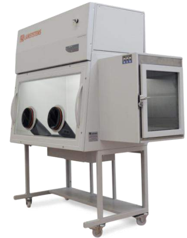
Glove Box Isolators