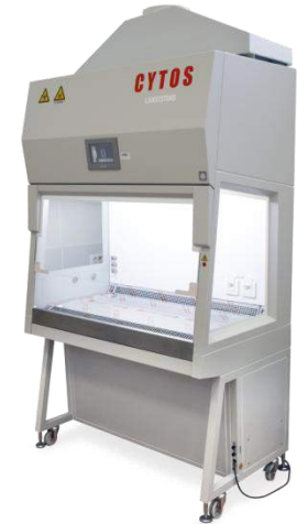
Class II TOXIC CYTOSTATIC