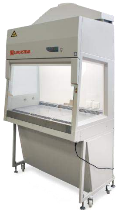
Class II Type B2