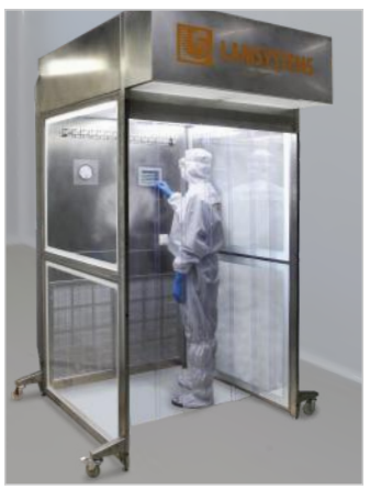
Laminar flow cabinet with light-absorbing work chamber