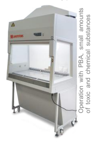
Class II Type B2