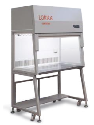
LAMINAR FLOW CABINETS